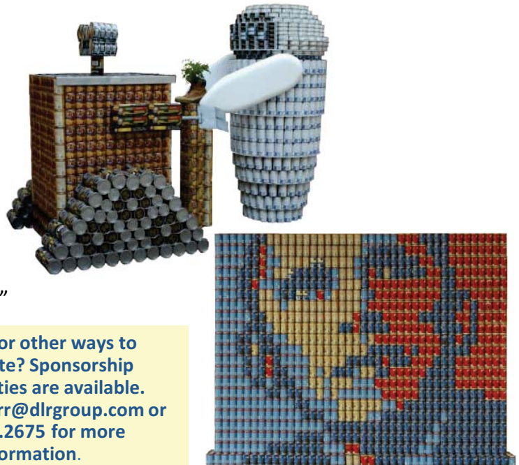
National canstruction winner 2009, GBD Architects, Glumac & ACE Students

It starts with one can. To feed the hungry. To lift someone's spirits. To Change the world. canstruction , a charity committed to ending hunger, is using "one can" as a catalyst for change. In an average month, an estimated 200,000 people ate from an emergency food box in Oregon and Clark County, Washington. An emergency food box provides a 3-to-5 day supply of food for a family. SDA Portland Chapters annual canstruction design and build competition puts a vital spotlight on hunger while showcasing our design community's best and brightest. Think you have what it takes to design and build a structure made of nothing more than canned food, ingenuity, and luck? Enter today, get creative and help stop hunger! "One Can" make a difference